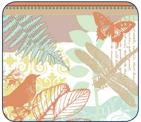
Sherwin-Williams' Gentle Medley, a color palette for 2011.

Benjamin Moore is naming 2011 the year of BALANCE , supported by four themes: The Farm , Order , Escape and Tribe . For more information, CLICK HERE .